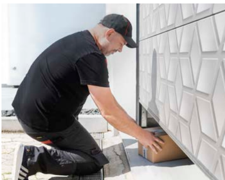
The door opens a short distance and closes automatically once the parcel has been deposited.