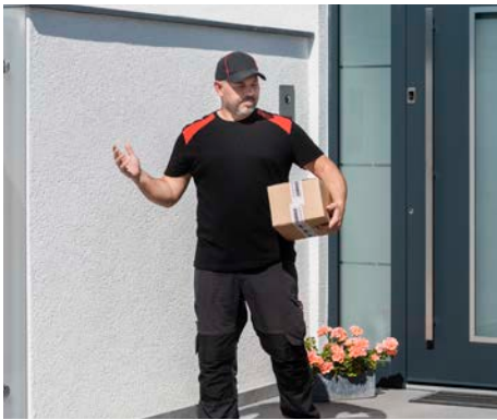
No-one is home, so a parcel cannot be delivered.

This smart courier function from SOMMER allows the delivery service employee to deposit a parcel in your garage. The opening width of the garage door can be defined individually. You can choose between two security levels: The door can be opened via the red button or a numeric code.