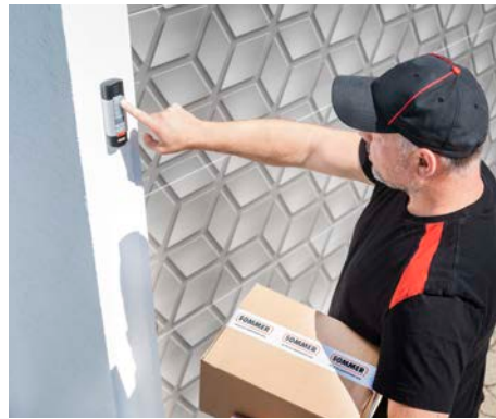
With the Telecody Courier, the parcel can be placed in your garage.