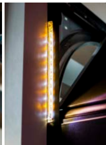
Lumi Strip lighting/ warning light