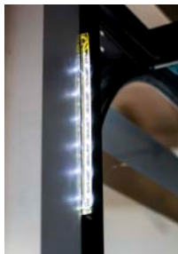
Lumi Strip lighting