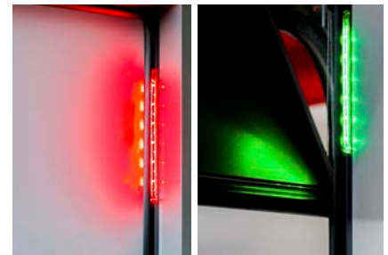
Lumi Strip traffic light

Date: 04/2018. Subject to misprints, errors and technical changes.